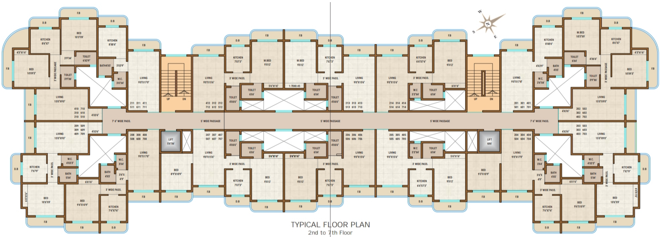
TYPICAL FLOOR PLAN 2nd to 7th Floor